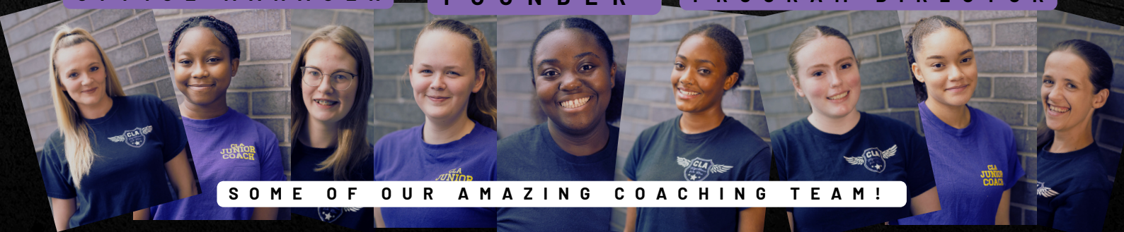
SOME OF OUR AMAZING COACHING TEAM!