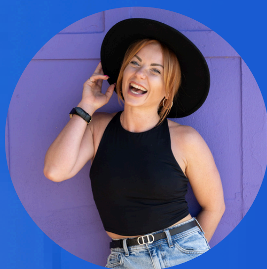
PBL Program Founder & CLA Founder and Director